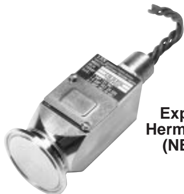
Explosion Proof Hermetically Sealed (NEMA 7 and 9)