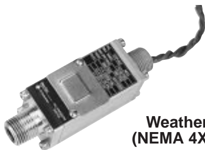
Weather Proof (NEMA 4X and 13)