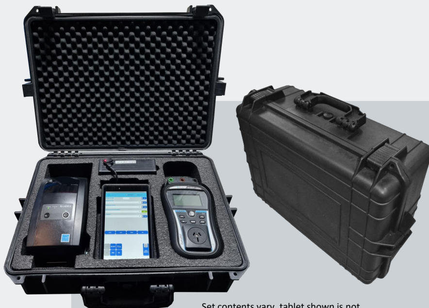
Set contents vary, tablet shown is not included standard

Appliance tester set including the Godex RT200 tag printer