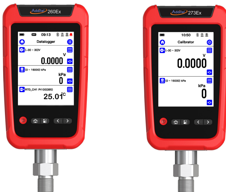
Additel 273Ex and 260Ex with ADT158 pressure module installed