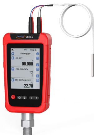
ADT260Ex with AM1602 temperature probe

Note: The ADT260Ex can be purchased without the ADT158Ex module If needed using the following part number: ADT260EX-NO