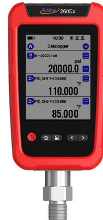
Additel 260Ex with ADT158Ex module