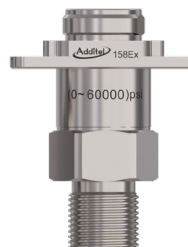
"ADT158Ex pressure module - for use with ADT260Ex (bottom mount)"