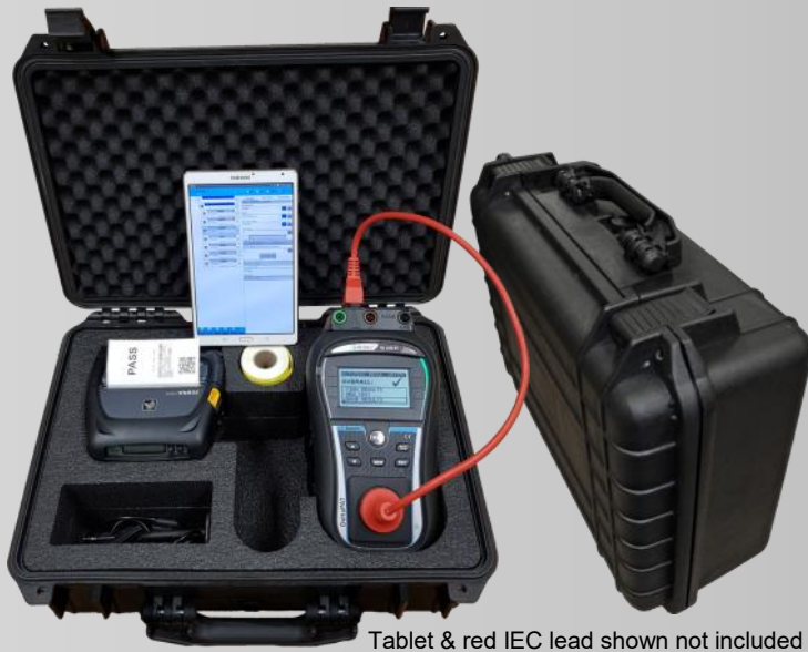
Tablet & red IEC lead shown not included

The Delta aPAT Pro Print Pack is an advanced complete Portable Appliance Testing solution. The pack comes with a Metrel Delta 3309BT, a Zebra ZQ521 printer for printing quality test tags with custom logos, the advanced aPAT android interface for data entry and all contained in a purpose built heavy duty safe case with custom cut insert. aPAT enables fast and simple data management of tested appliances, as well as a quick overview of already performed tests by simply scanning a QR code. The application enables the user to send results to the main office before leaving test sites, enter and save data by using a smart phone or tablet keyboard. All these features enable the user faster and easier data handling.