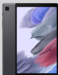
Item #: SST3

These are thermal transfer labels and ribbons also available