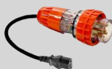
Item #: 3PSA

We do also have some thermal transfer type and ribbons available for use with the P4T.