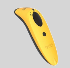
Item #: Socket S740

Handy for appliances such as laptop chargers and more!