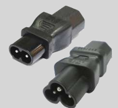
Item #: IECADAPT

This license unlocks some additional advanced reporting features