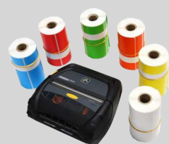
Item #: TDD

This little gadget will ensure that removing your test tags is a simple and safe process. It has two covered blades that can slide between a cable and the test tag easily to cut it off.