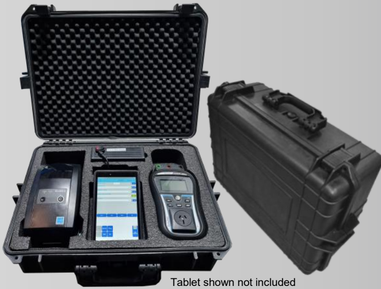
Tablet shown not included

The recently updated Metrel DeltaPAT Complete Kit now comes with the updated Godex Label Printer which has internal Bluetooth (older models required external dongles). You'll be able to connect your DeltaPAT 3309 tester, android device and Godex printer seamlessly via Bluetooth.