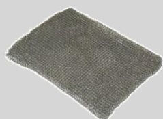
Item #: INSCLOAK

Handy for appliances such as laptop chargers and more!