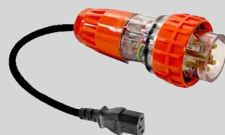
Item #: 3PSA

This 3-phase adaptor is a suitable solution for testing both 4 and 5 pin & 10 - 40A 3 phase equipment. (20amp & 32amp sockets) This allows a PAT to conduct an Earth bond and Insulation Resistance test on a 3-phase device