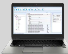
Item #: P-1101

These only suit 5-pin three phase sockets available in 20A or 32A socket variants