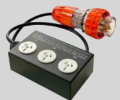
Item #: RCD-3P

Used for the DeltaPAT 3309BT used in conjunction with the 3PTL adaptors, these adaptors have an exposed earth core which you put the clamp around to measure leakage on 3 phase appliances