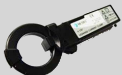
Item #: A-1472

Available in a few variants and used with the 3PMA, these adaptors remove the need to hold the S/EB probe onto the earth pin of the extension cord. It also allows you to perform a limited polarity test for 3-phase 5pin extension leads