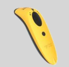
Item #: Socket S740

This license unlocks some additional advanced reporting features