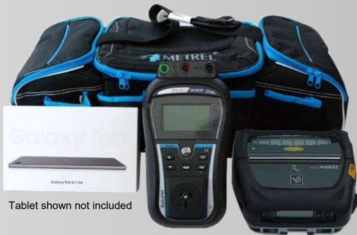
Tablet shown not included

The DeltaPAT Go Print kit offers an advanced portable appliance testing solution and a large number of highly unique features that will transform the way you test and tag. This kit offers an alternative solution to our original Metrel DeltaPAT aPAT kit that instead of being supplied in a custom heavy duty transit case is supplied in a soft lightweight Metrel carry bag.