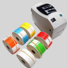
Item #: VTT

We do also have some thermal transfer type and ribbons available for use with the P4T.