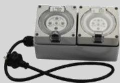
Item #: 3PMA