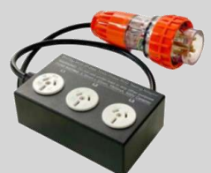
Item #: RCD-3P