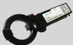
Item #: A-1472

This 3-phase adaptor is a suitable solution for testing both 4 and 5 pin & 10 - 40A 3 phase equipment. (20amp & 32amp sockets) This allows a PAT to conduct an Earth bond and Insulation Resistance test on a 3-phase device