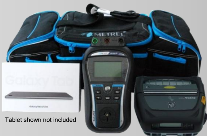
Tablet shown not included

The DeltaPAT Go Print kit offers an advanced portable appliance testing solution and a large number of highly unique features that will transform the way you test and tag. This kit offers an alternative solution to our original Metrel DeltaPAT aPAT kit that instead of being supplied in a custom heavy duty transit case is supplied in a soft lightweight Metrel carry bag.