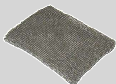
Item #: INSCLOAK

We can offer hand held, battery powered, portable 2D barcode scanner enabling you to scan barcodes and QR codes. This can be used with the OmegaPAT MI3360 and also the MI3309 via the aPAT app if you prefer not to use the tablets on board camera.