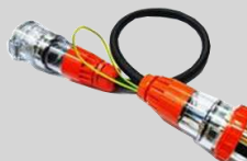
Item #: 3PTL

Used for the DeltaPAT 3309BT used in conjunction with the 3PTL adaptors, these adaptors have an exposed earth core which you put the clamp around to measure leakage on 3 phase appliances