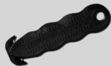
Item #: TAGCUT

We can offer hand held, battery powered, portable 2D barcode scanner enabling you to scan barcodes and QR codes. This can be used with the OmegaPAT MI3360 and also the MI3309 via the aPAT app if you prefer not to use the tablets on board camera. It's included with the Alpha pro print pack