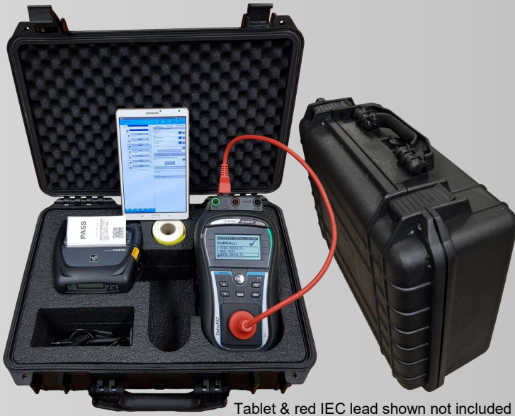
Tablet & red IEC lead shown not included

The Delta aPAT Pro Print Pack is an advanced complete Portable Appliance Testing solution. The pack comes with a Metrel Delta 3309BT, a Zebra ZQ521 printer for printing quality test tags with custom logos, the advanced aPAT android interface for data entry and all contained in a purpose built heavy duty safe case with custom cut insert. aPAT enables fast and simple data management of tested appliances, as well as a quick overview of already performed tests by simply scanning a QR code. The application enables the user to send results to the main office before leaving test sites, enter and save data by using a smart phone or tablet keyboard. All these features enable the user faster and easier data handling.