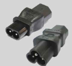
Item #: IECADAPT

These only suit 5-pin three phase sockets available in 20A or 32A socket variants