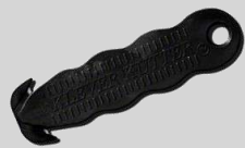
Item #: TAGCUT

Constructed from stainless steel mesh, they are designed for use in testing Class II appliances and replace perishable items such as aluminium foil