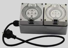
Item #: 3PMA