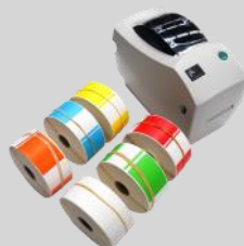
Item #: VTT

This little gadget will ensure that removing your test tags is a simple and safe process. It has two covered blades that can slide between a cable and the test tag easily to cut it off.