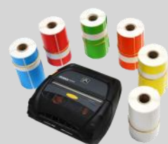
Item #: TDD

Constructed from stainless steel mesh, they are designed for use in testing Class II appliances and replace perishable items such as aluminium foil