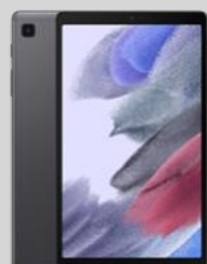
Item #: SST3

These are thermal transfer labels and ribbons also available