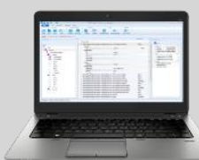
Item #: P-1101